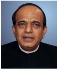
Dinesh Trivedi Former Minister of Railways and Member of Parliament, Lok Sabha, India