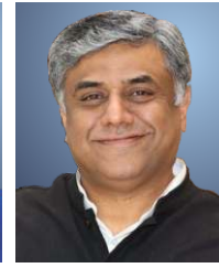
Rajeev Gowda Member of Parliament, Rajya Sabha, India