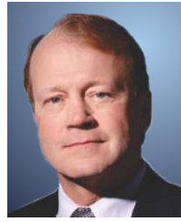
John T Chambers Founder and CEO, JC2 Ventures & Chairman Emeritus, Cisco