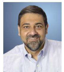
Vivek Wadhwa Academic, Researcher, Writer & an Entrepreneur