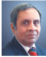
Venkatesan Ashok Consul General of India San Francisco